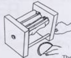
The finished product drops at the bottom.