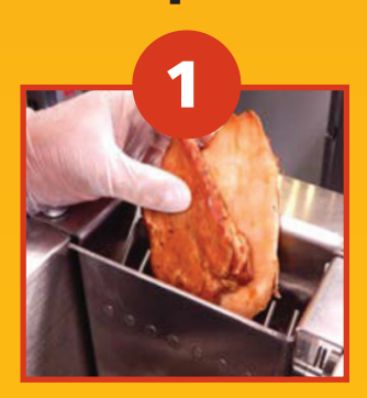
Place the protein into chamber