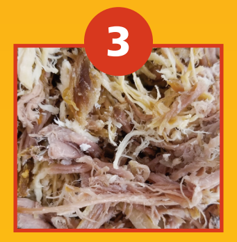
Finished product drops into bucket!